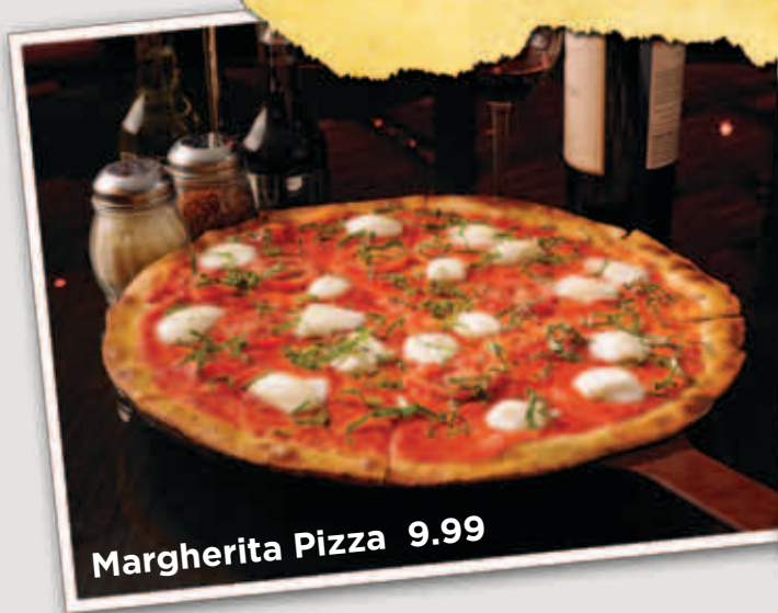
Margherita Pizza 9.99

Includes House Salad, Caesar Salad or Minestrone Soup