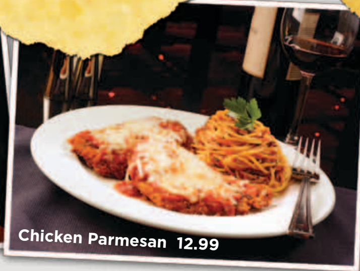
Chicken Parmesan 12.99