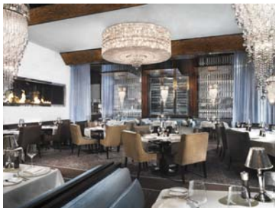
Hank's Fine Steaks & Martinis

The ultimate culinary experience awaits at one of Green Valley Ranch's nine restaurants to satisfy every taste bud and budget, including: