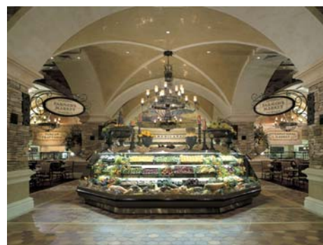
Feast Around The World Buffet